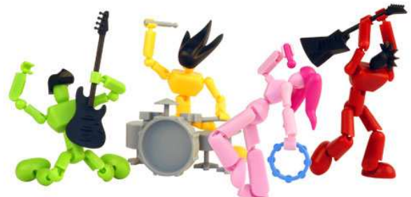
Band: The John Lamos Band

Cost: $75.00/camper (includes all meals, accommodation and programming) Please make cheques payable to Main Street Baptist Church.